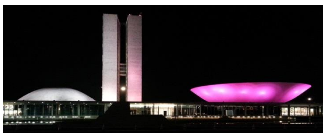
House of Representatives, Chamber of Deputies in pink following a request of AMPOL and IPA Brazil 27.

police officers to 25 years, provided that they have worked at least 15 years strictly as police officers.