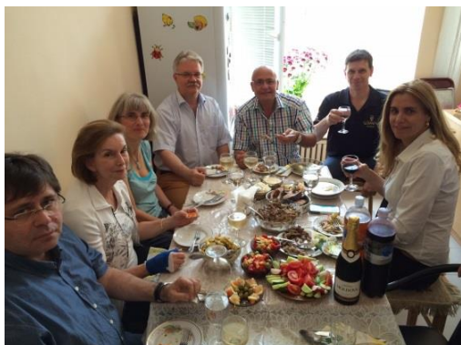
Thank your for a fantastic meal!

If someone had told me a few years ago that I would be travelling to a place like Moldova: